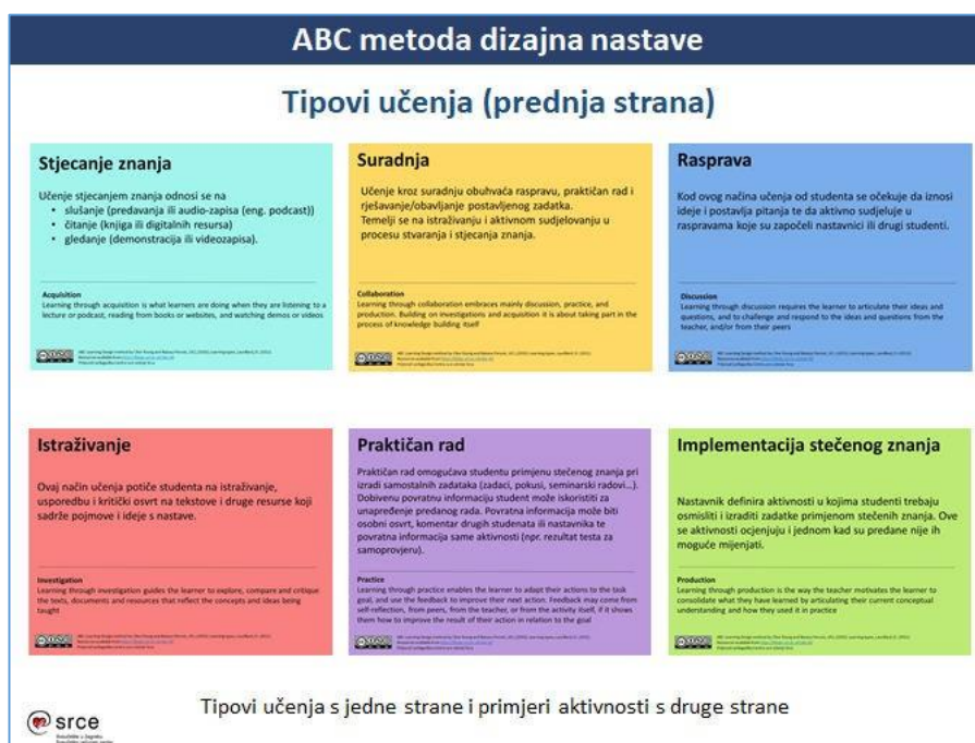
Figure 1. ABC cards with learning types in Croatian

In order to provide additional information to teachers and all interested in the ABCtoVLE project, ELC has prepared a webpage in Croatian with all translated materials related to the ABC workshop and there regularly published the information related to the project ( https://www.srce.unizg.hr/centar-za-e-ucenje/medunarodna-suradnja/abc-vle ).